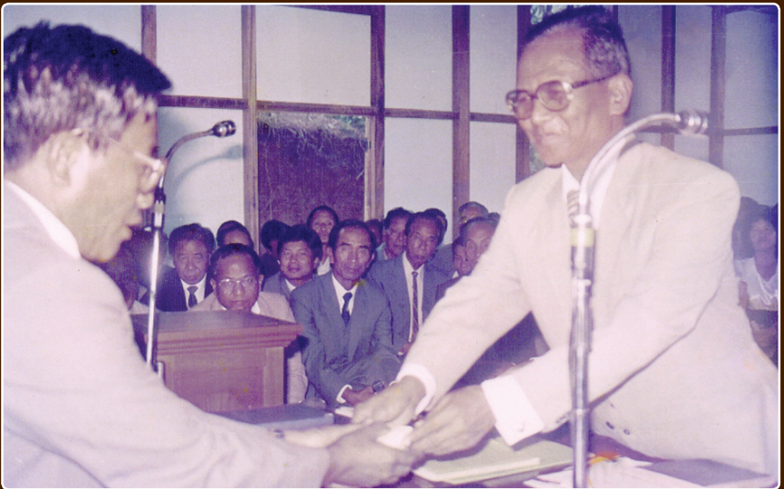
Upa Siliana'n Kohhran Seal a dawng