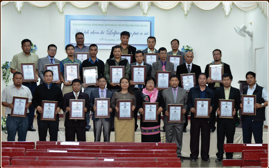
Silver Jubilee lawmna - Branch K.T.P Office Bearers lo ni tawhte chawimawina hlan a ni.