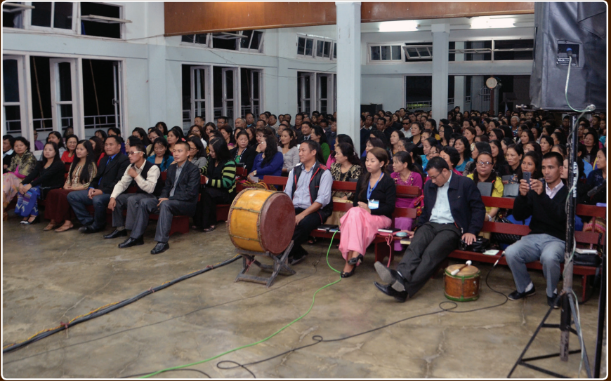
Silver lawmna - Kohhran Hall