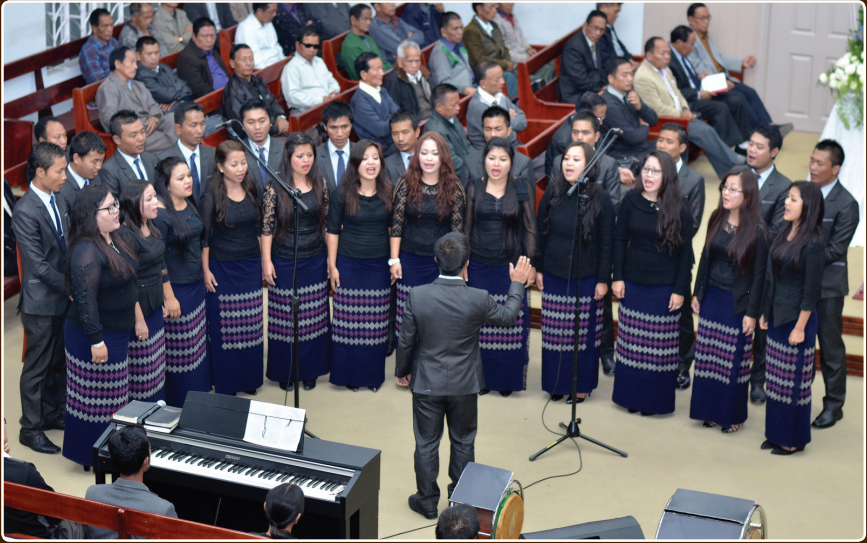
Silver Jubilee lawmna inkhawmah Bial Zaipawl an zai