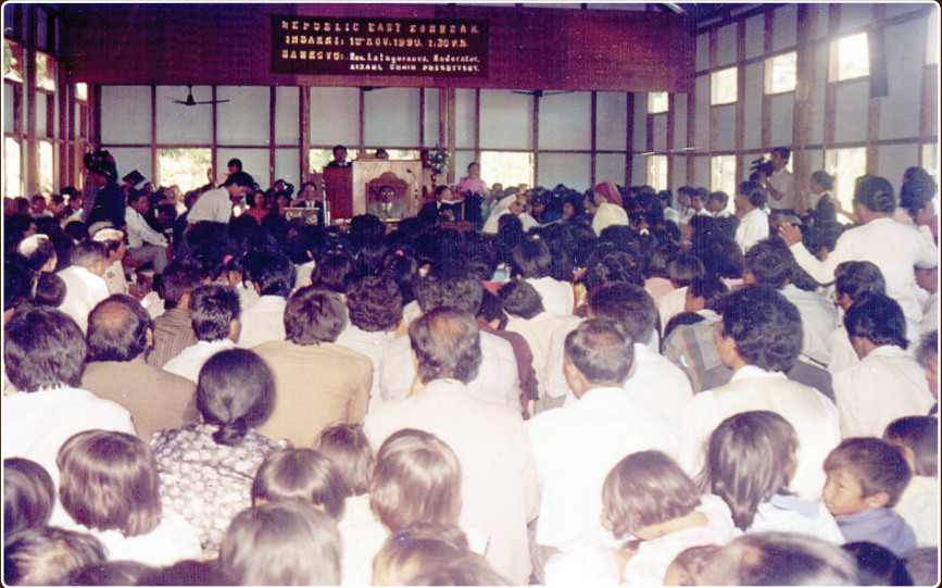
Biak In hawn inkhawm