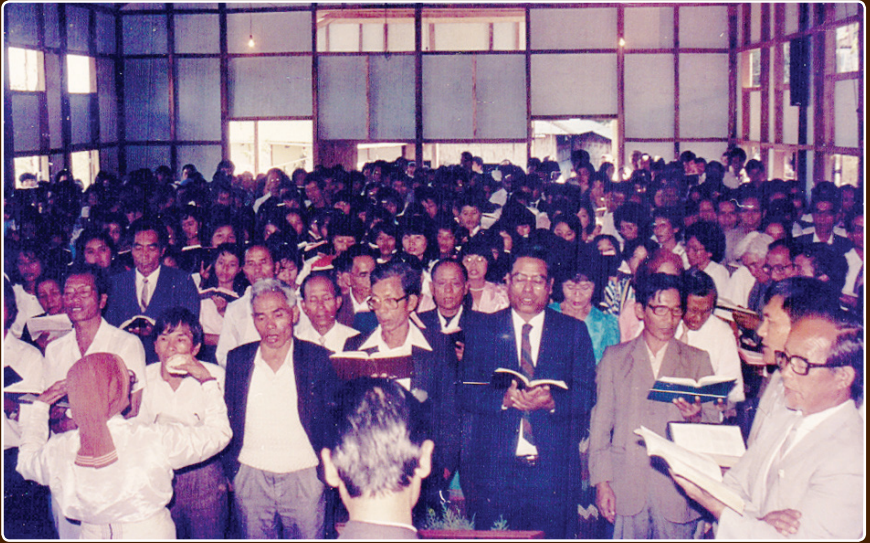
Kohran indan inkhawm