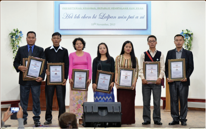
Silver Jubilee lawmnaa kan Kohhran atanga chhuak Missionary rawn tel te