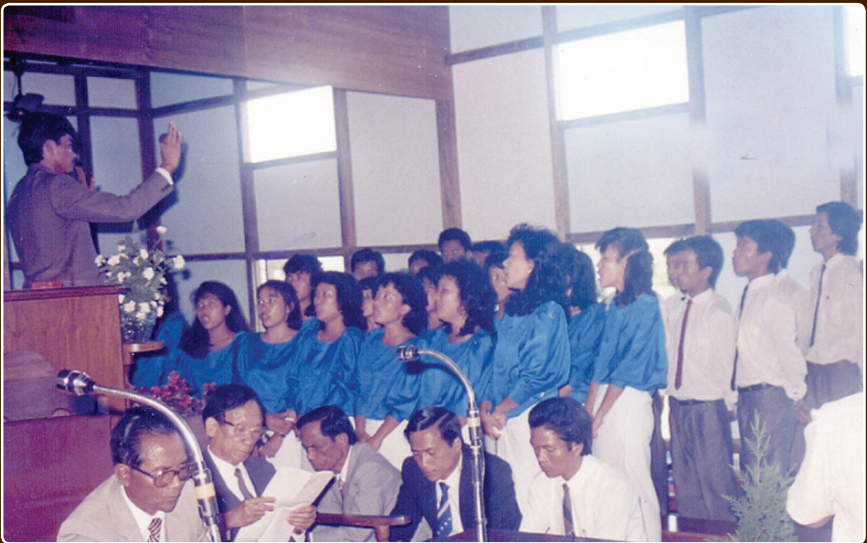
Kohhran a lo pianin Bial Zaipawl an zai