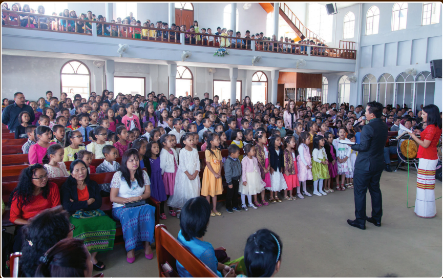
Silver Jubilee lawmna inkhawmah Pathian Ni Naupang Inkhawm Zaipawl an zai