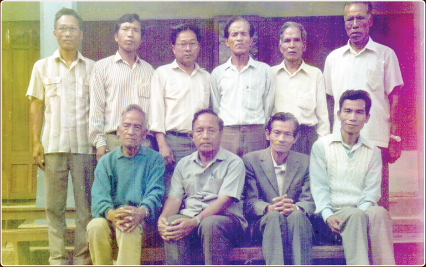
Preaching Station Committee