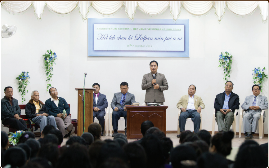
Silver Jubilee lawmna Variety Programme