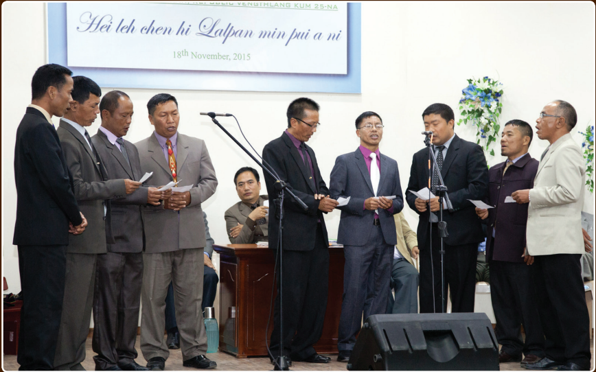
Silver Jubilee lawmna - Thian pawlho zai