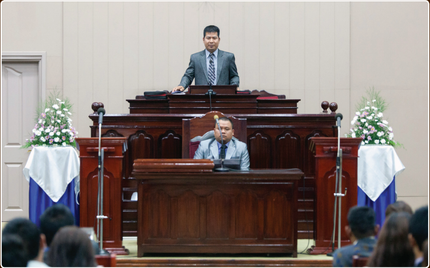
Silver Jubilee lawmna - Kristian Thalai Pawl pual