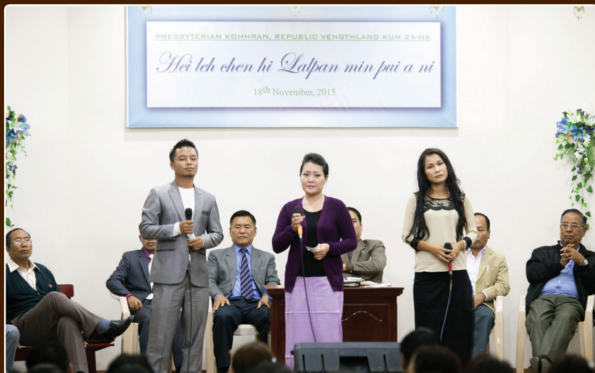
Silver Jubilee lawmna - Fakna hlan tute an zai