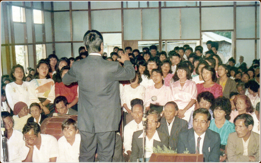
Preaching Station Zaipawl