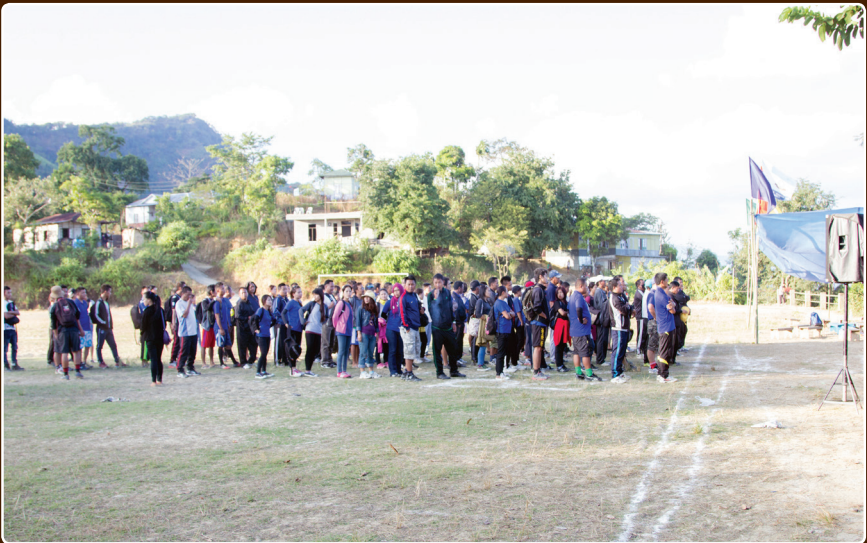
Silver Jubilee Sports - KTP