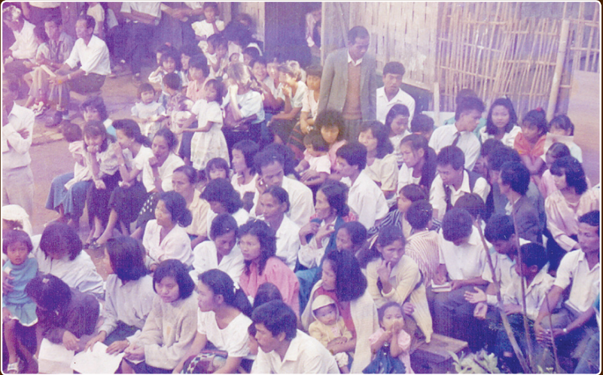
Biak In hawn - Inkhawm Biak In-a leng lo