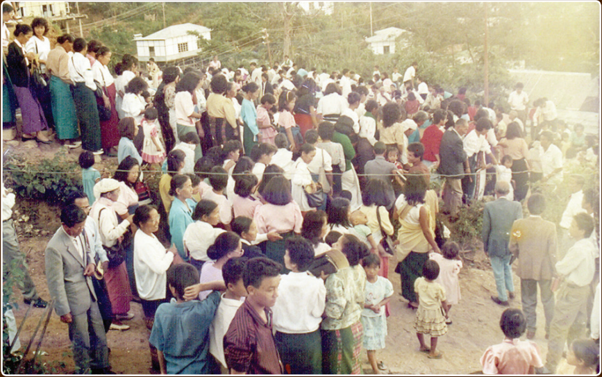
Biak In hawn inkhawm bang (Biak In kawmthlang)