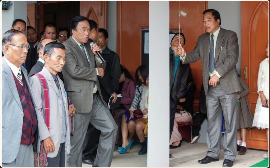
Silver Jubilee - Jubilee dar vuak