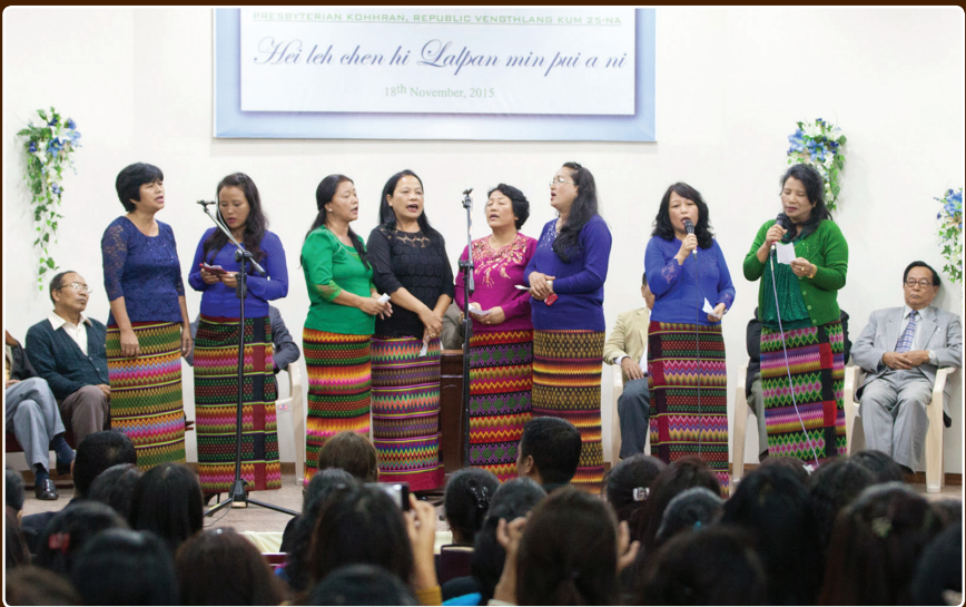
Silver Jubilee lawmna - Thian pawlho zai