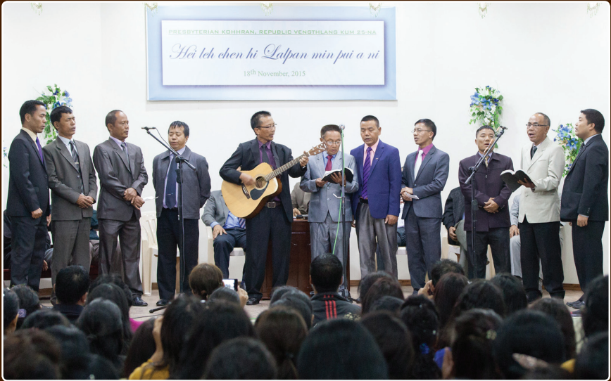
Silver Jubilee lawmna - Thian pawlho zai