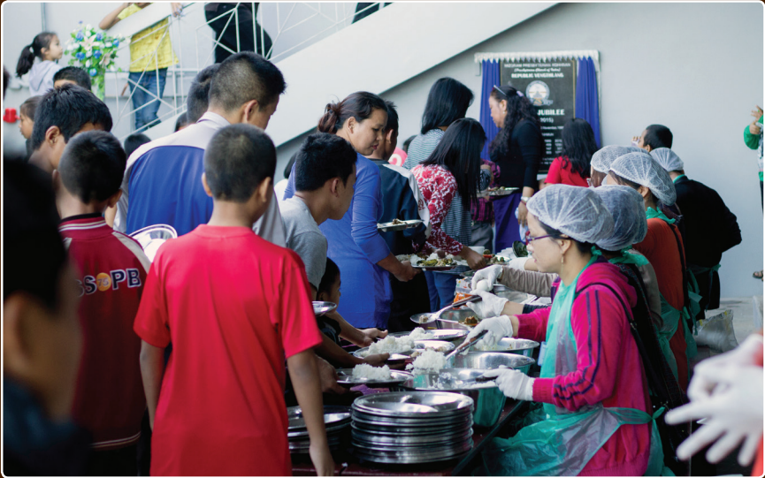
Silver Jubilee lawmna ruaitheh