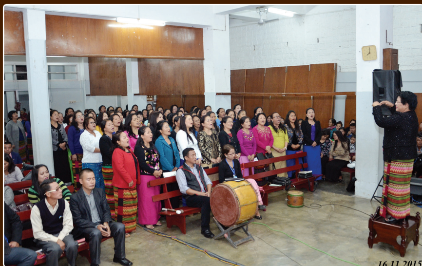
Silver Jubilee lawmna - Kohhran Hmeichhia Zaipawl