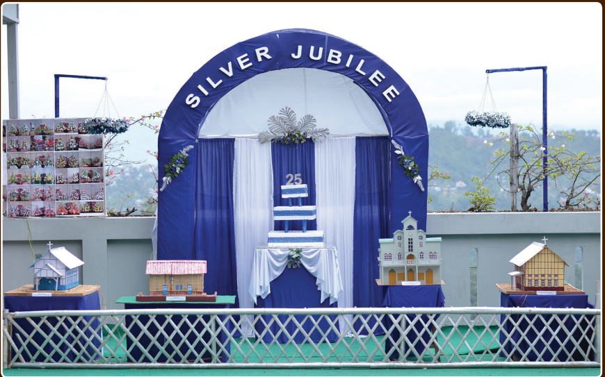
Silver Jubilee lawmna - Decoration