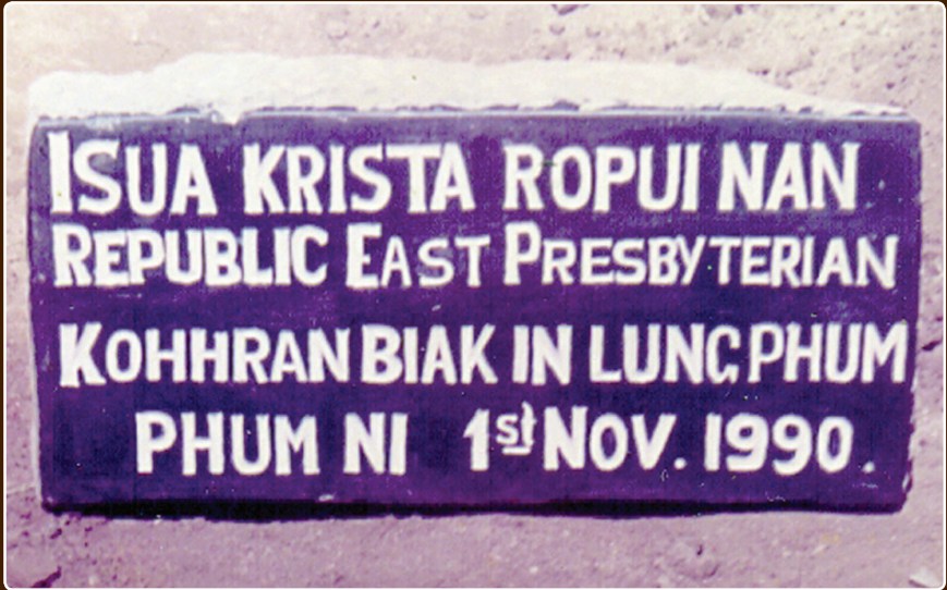
Biak In lungphum