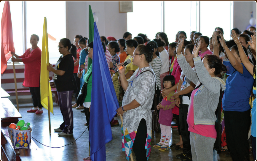
Silver Jubilee lawmna - Kohhran Hmeichhe Sports