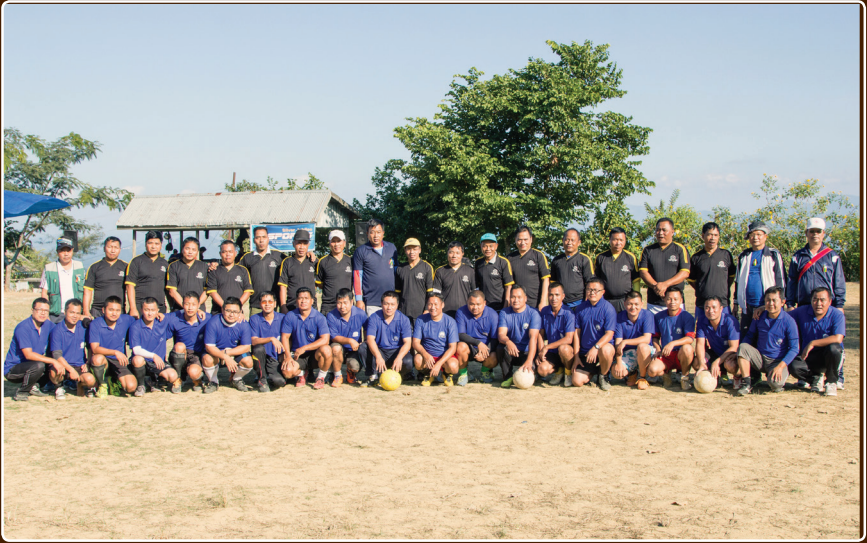
Silver Jubilee Sports - KTP