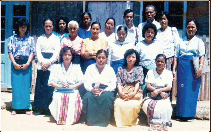
Kohhran Hmeichhe Committee 1990