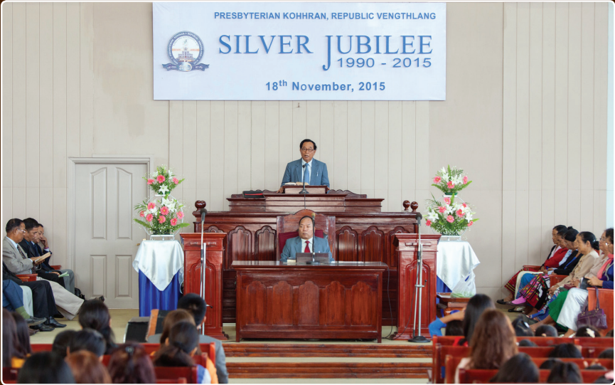
Silver Jubilee lawmna Kohhran Inkhawm