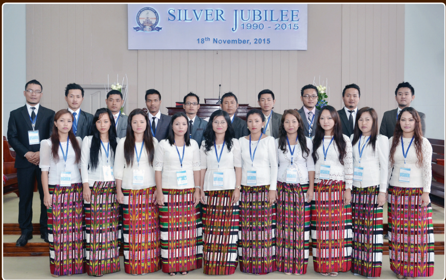
Silver Jubilee lawmna - Ushers