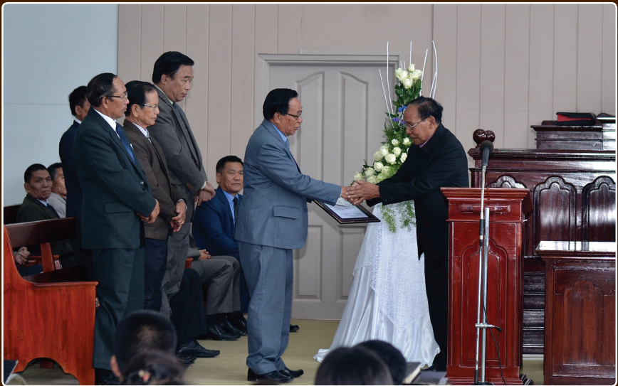
Silver Jubilee lawmpuina Republic Kohhran (Hringtu Kohhran) atangin dawn a ni