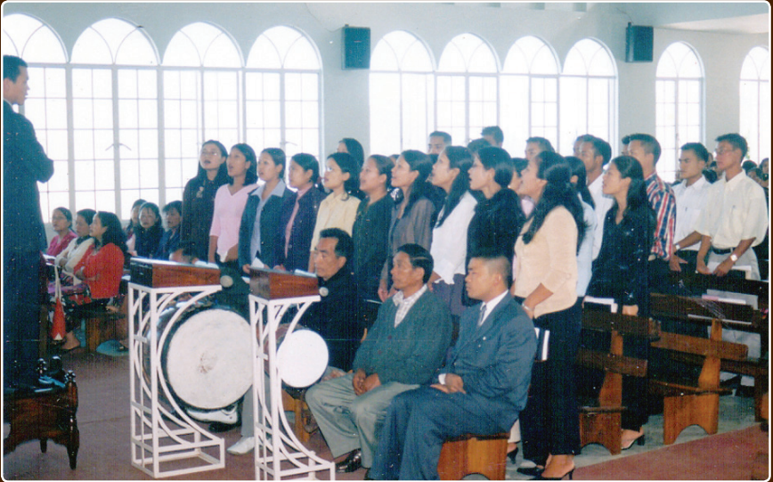
Biak In hawn inkhawmah Kohhran Zai pawl an zai