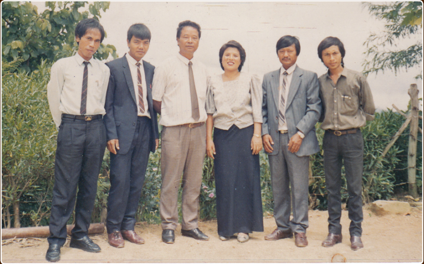
Branch K.T.P Office Bearers 1990