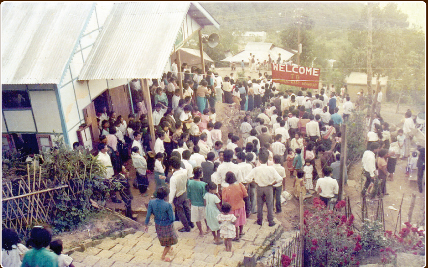
Biak In - Inkhawm ban (Kohran indan ni)