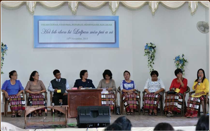
Silver Jubilee lawmna - Kohhran Hmeichhe pual