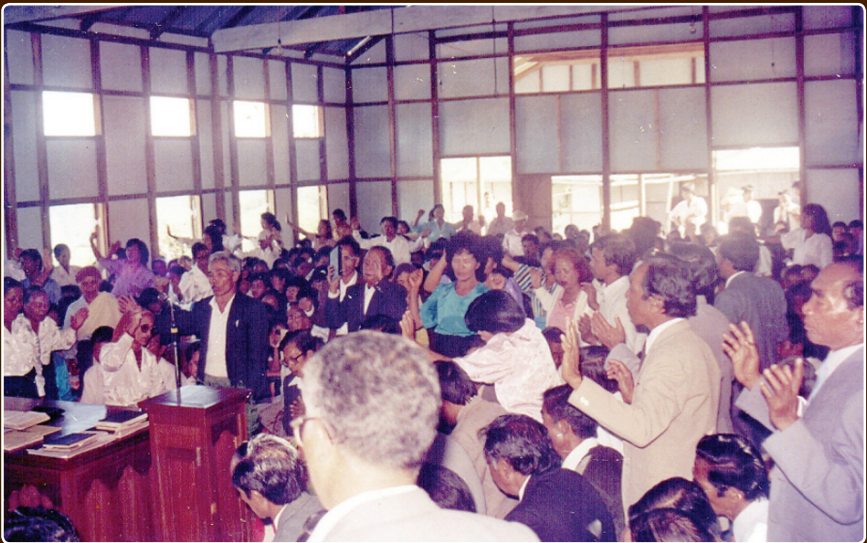
Biak In hawn inkhawm