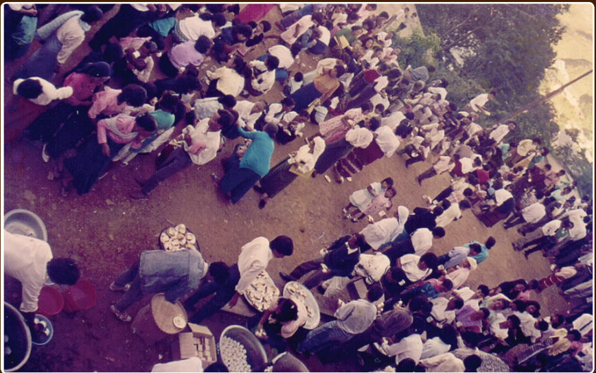
Biak In hawn - Thingpui ruai (Biak In kawmthlang zawl)