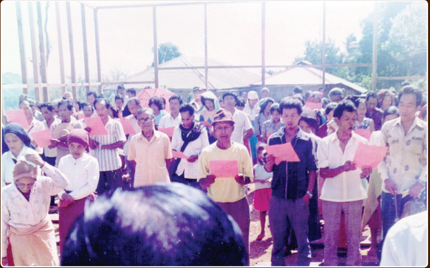
Biak In lungphum phum inkhawm