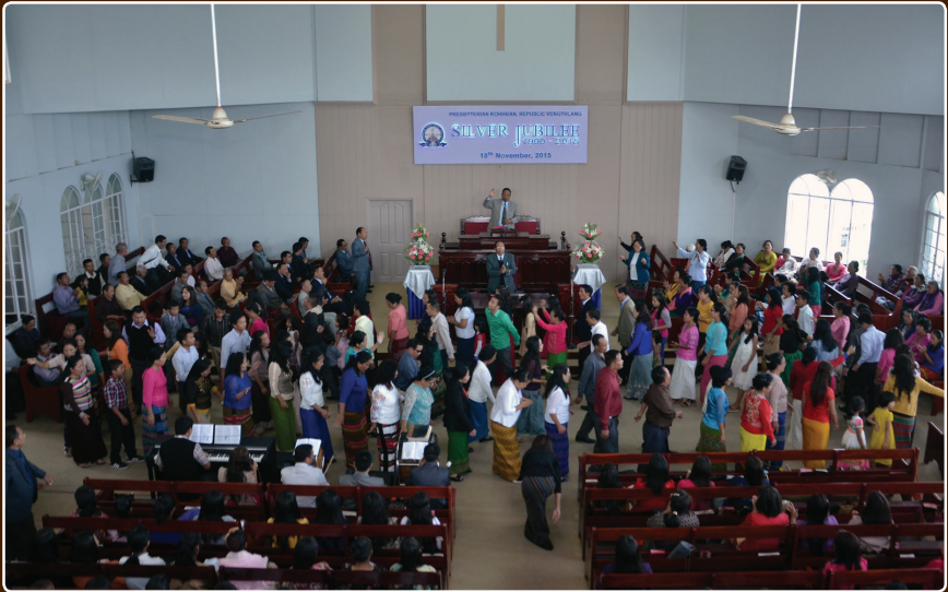
Silver Jubilee lawmna - Kohhran Inkhawm