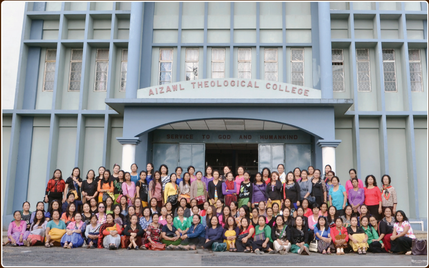
Silver Jubilee lawmna - Kohhran Hmeichhia ten hmun pawimawh an tlawh