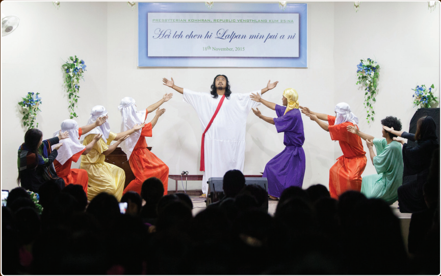
Silver Jubilee lawmna - Short Play