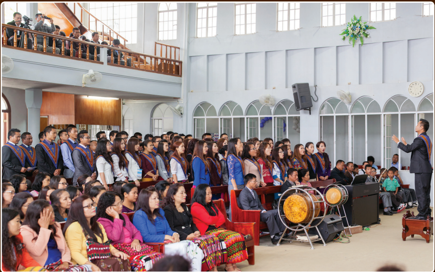
Silver Jubilee lawmna inkhawmah Kohran Zaipawl an zai