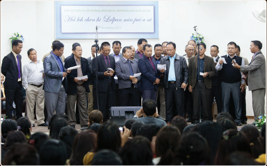
Silver Jubilee - Pavalai Zaipawl