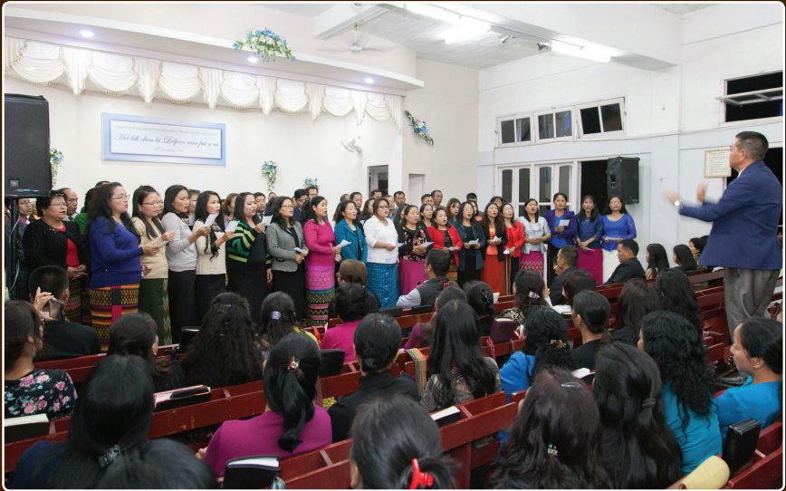
Silver Jubilee lawmna - Hranghlui zaipawl an zai