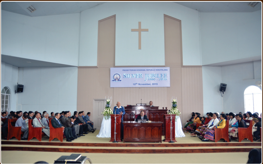
Silver Jubilee lawmna - Kohran Inkhawm