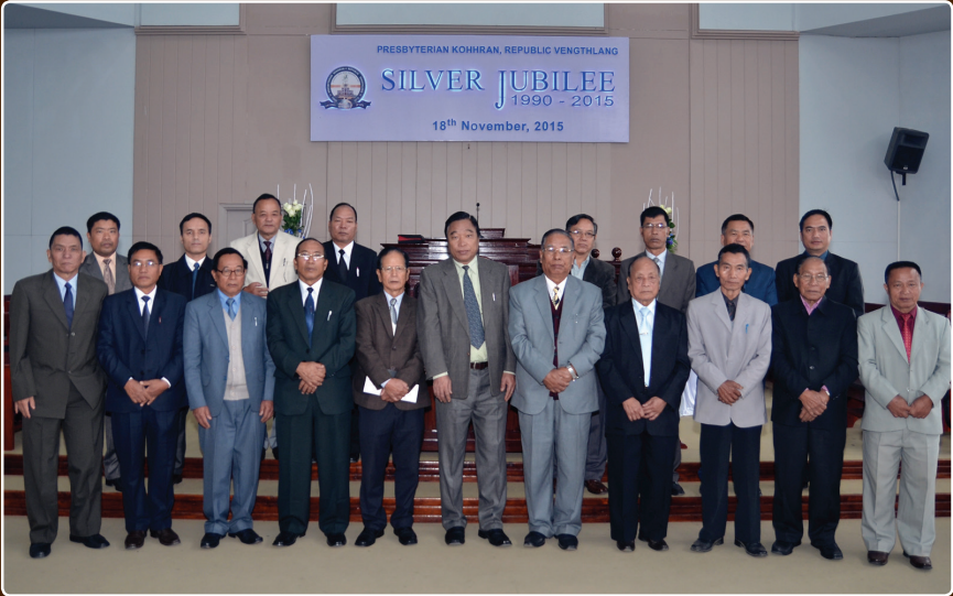
Silver Jubilee lawmna-a Ordained lo kal te nen