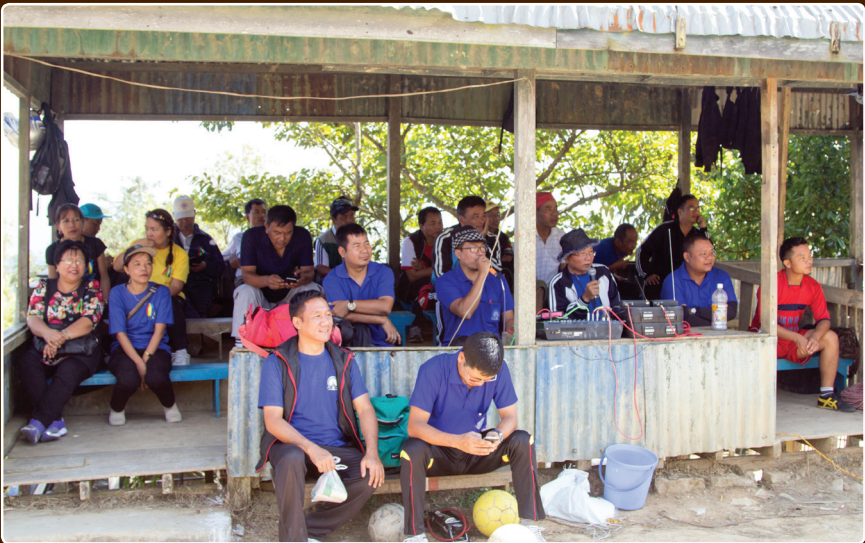
Silver Jubilee Sports - KTP