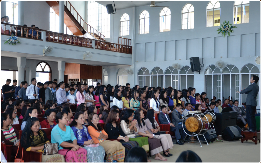
Silver Jubilee lawmna inkhawmah Christian Teenager Group Zaipawl an zai