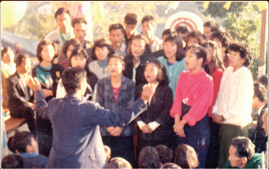
Kohhran Zai pawl - Centenary lawmna