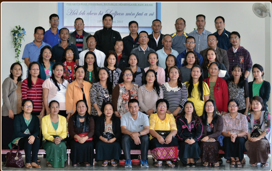
Silver Jubilee lawmna - Hranghlui zaipawl