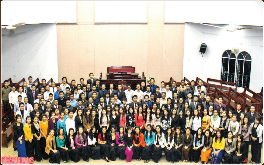
Branch K.T.P member 2013