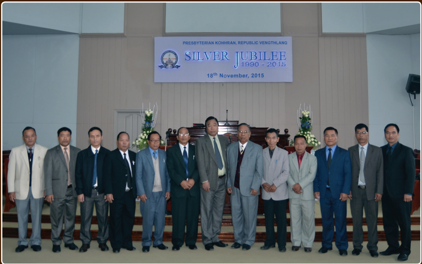
Silver Jubilee - Kohhran Committee