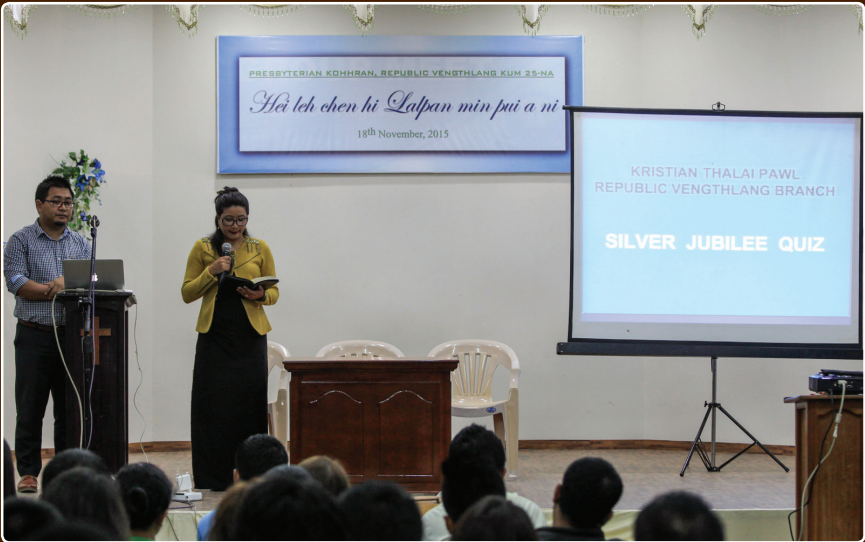
Silver Jubilee lawmna - K.T.P Pual Quiz